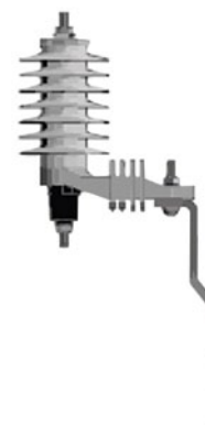
Figure 2. Transformer bracket.